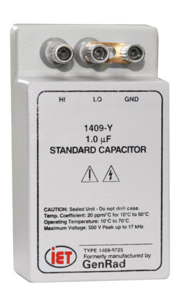
Figure 3-1: 1409 capacitor standard Figure 3-2:

1409 capacitors have 3 binding posts -- HI, LO, and GND -- as shown in figure 3-1.