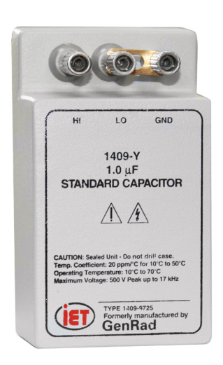
Figure 1-1: 1409 Series Capacitance Standard

A well is provided in the wall of the case for inserting a dial-type thermometer. For convenient parallel connection without error, three jack-top binding posts are provided on the top case, with removable plugs on the bottom.