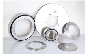
◆ Grinding Samples 研磨產品範例