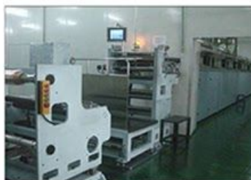
涂布机 (Coating M/C)