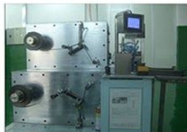
大片裁切机 (Cutting M/C)