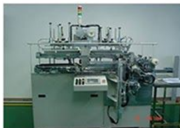
制片 (production M/C)