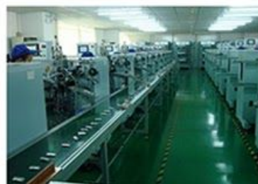
Winding line (auto)