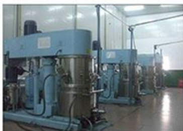
搅拌机 (Mixing M/C)