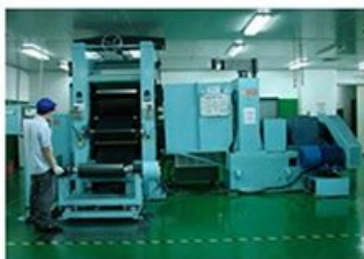
Pressing line (auto)