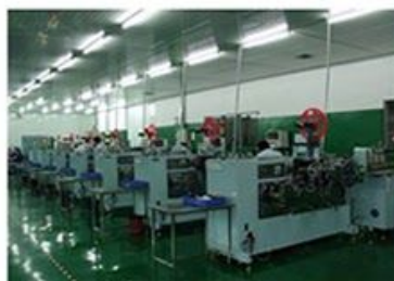
Electronic production line (auto)