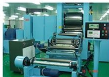
辊压机 (Pressing M/C)