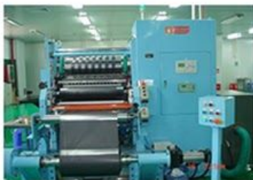
分切 (Slitting M/C)