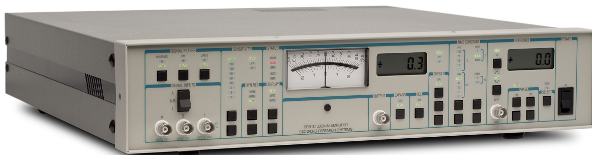
SR510 Lock-In Amplifier

An optional internal voltage-controlled oscillator provides both an adjustable-amplitude sine wave output and a synchronous, fixed-amplitude reference output. The sine wave amplitude can be set to 0.01, 0.1 or 1 Vrms, and can drive up to 20 mA. The oscillator frequency is controlled by a rear-panel voltage input and can be adjusted between 1 Hz and 100 kHz. Typically, the sine wave output is used to excite some aspect of an experiment, while the reference output provides a frequency reference to the lock-in.