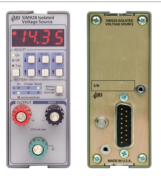
Figure 1.1: The SIM928 front and rear panels.